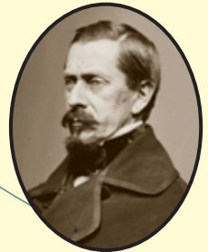
Gen. George A. McCall