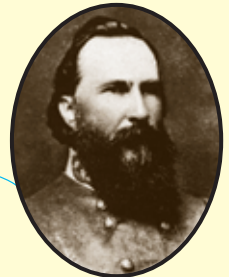
Gen. James Longstreet